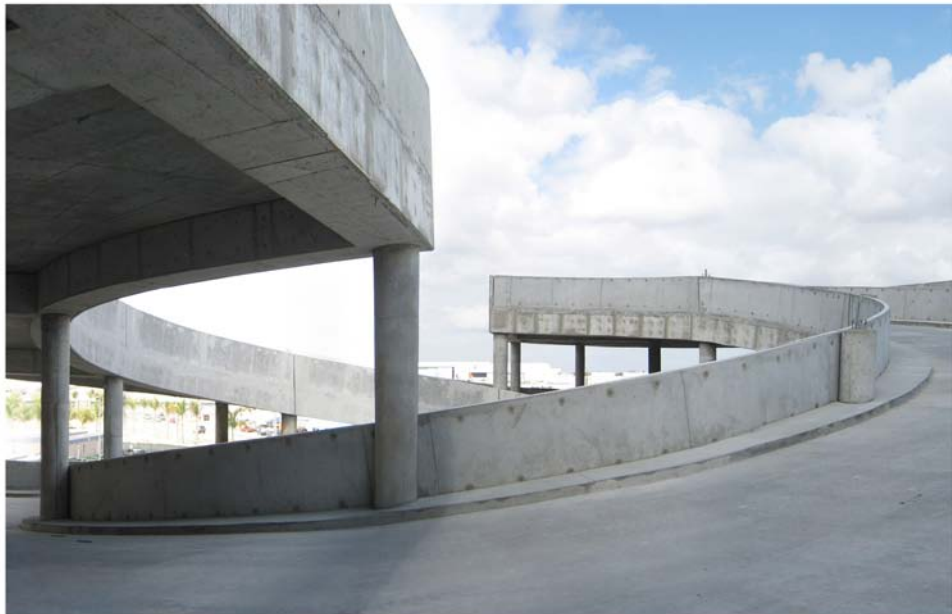
Miami Intermodal Center Construction: Progress Photo March 13, 2009 Rental Car Center (RCC) FM # 249937-5 View of poured crash walls on North Helix ramp