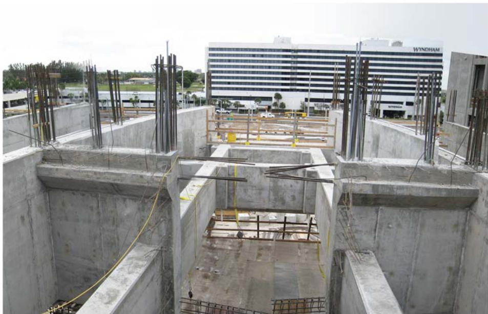
Miami Intermodal Center Construction: Progress Photo March 13, 2009 Rental Car Center (RCC): FM # 249937-5 / MIC-MIA Station: FM # 406800-6 View of MIC-MIA Connector Station Platform Construction