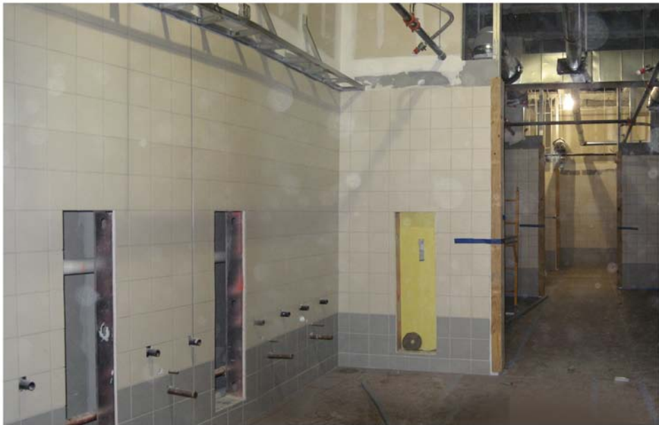
Miami Intermodal Center Construction: Progress Photo March 13, 2009 Rental Car Center (RCC): FM # 249937-5 Construction of RCC restrooms