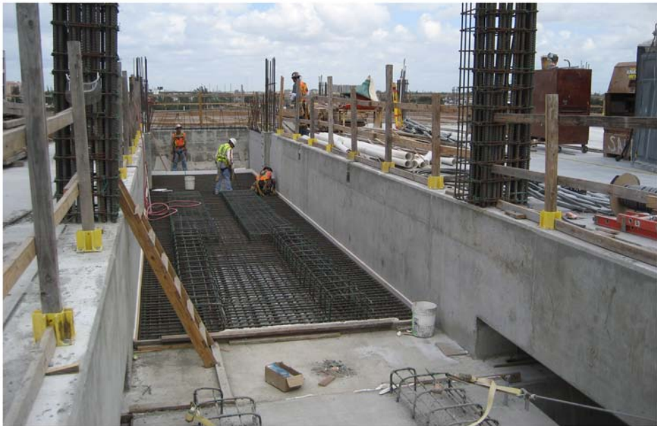
Miami Intermodal Center Construction: Progress Photo March 13, 2009 Rental Car Center (RCC): FM # 249937-5 / MIC-MIA Station: FM # 406800-6 View of MIC-MIA Connector Station Platform Construction