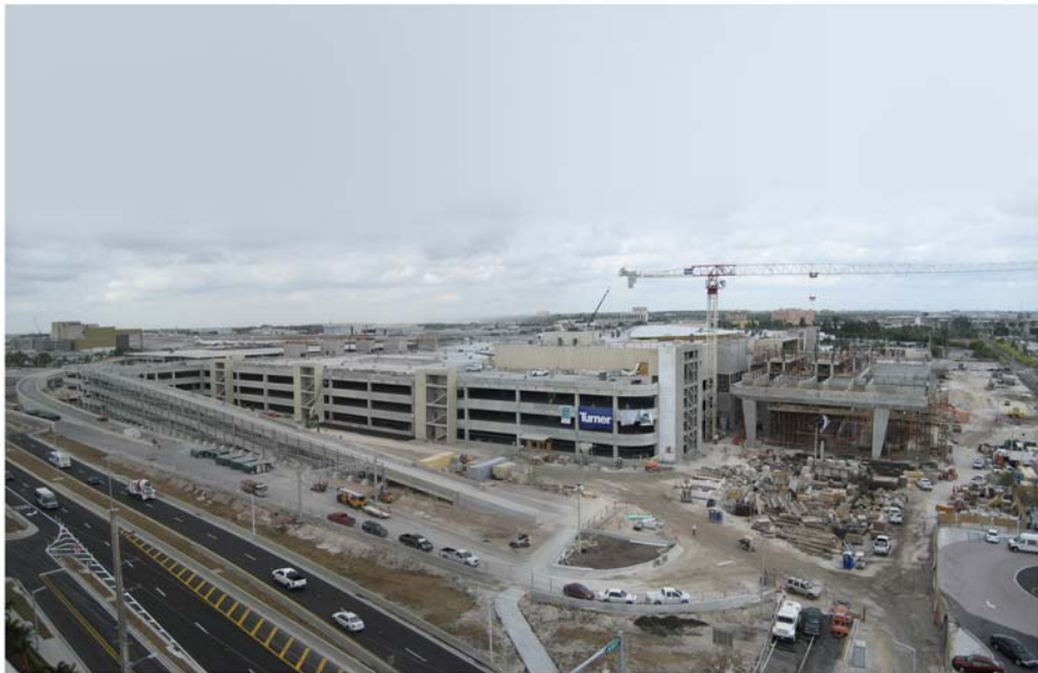
Miami Intermodal Center Construction: Progress Photo March 13, 2009 Rental Car Center (RCC): FM # 249937-5 Construction of RCC South Ramp and Improvements to NW 21st Street