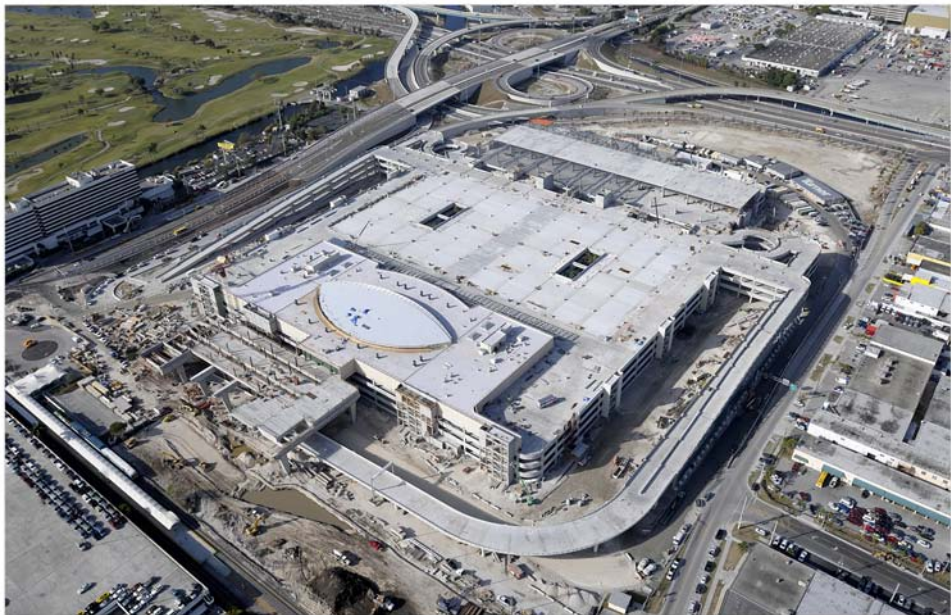
Miami Intermodal Center Construction: Progress Photo March 13, 2009 Rental Car Center (RCC): FM # 249937-5 Southwest View of RCC Construction Site