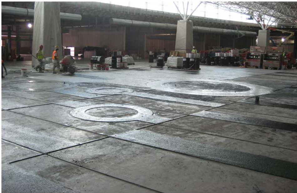
Miami Intermodal Center Construction: Progress Photo March 13, 2009 Rental Car Center (RCC): FM # 249937-5 RCC Lobby Terrazo floor construction