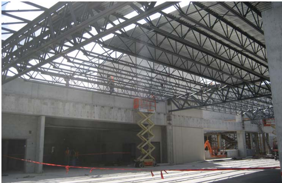
Miami Intermodal Center Construction: Progress Photo March 13, 2009 Rental Car Center (RCC): FM # 249937-5 Construction of roof over RCC