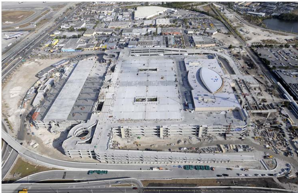
Miami Intermodal Center Construction: Progress Photo March 13, 2009 Rental Car Center (RCC): FM # 249937-5 Northwest View of RCC Construction Site